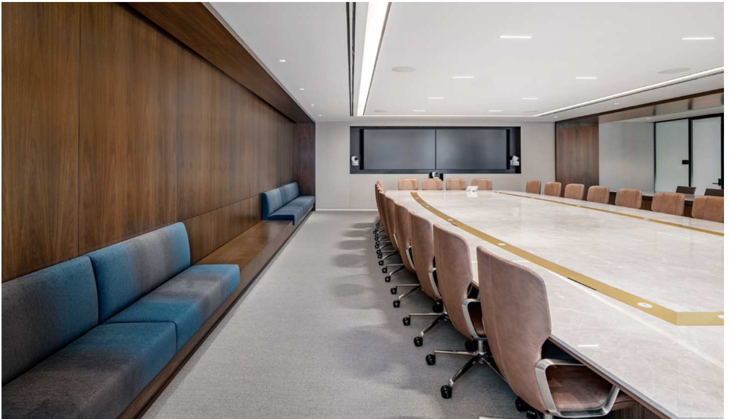
Three backrest heights and base frames with casters or glides make these chairs ideal for a variety of settings ranging from offices or boardrooms.