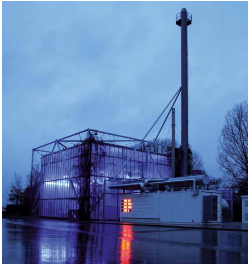
Co-generator powered by renewable raw materials