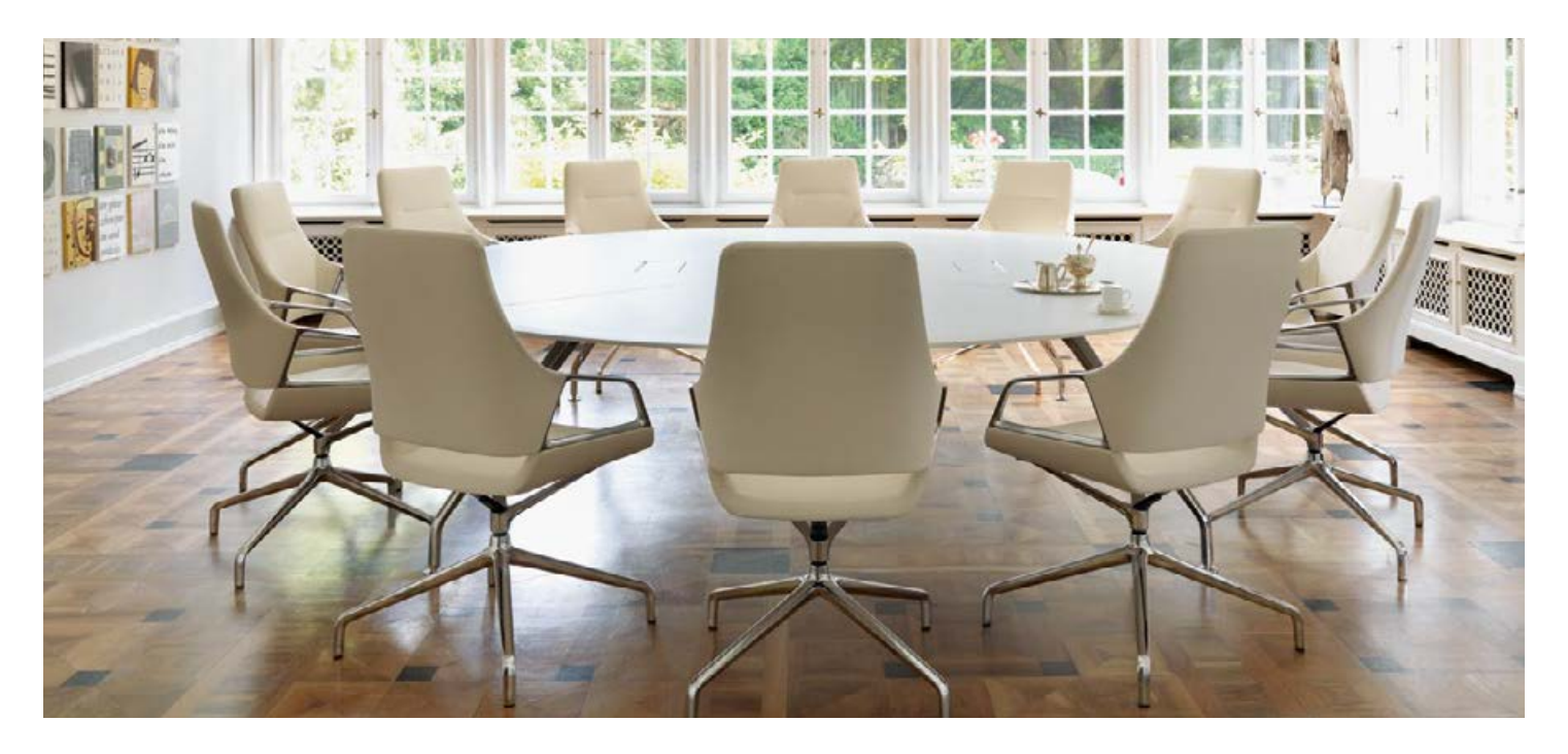
Table tops that project far and large spans allow round conference-table formats of three metres in diameter. With only four table legs required, there's enough space for 12 chairs.